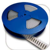
SMD connector reel