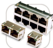
RJ45 modular jacks