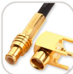
RF cable and jack