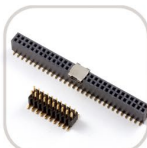
Header and socket