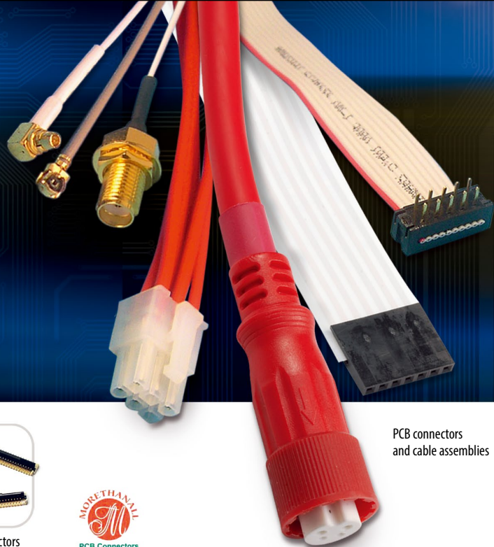
PCB connectors and cable assemblies