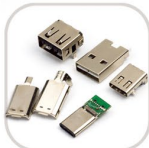
USB Type-C™ connectors