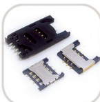
SIM card socket connectors